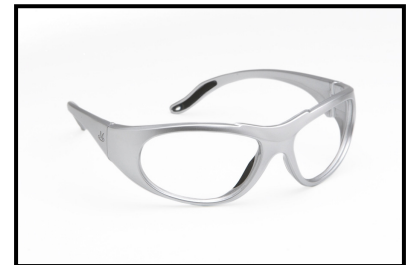
MicroLite8 midnight blue, Model FB108B (above) and silver, Model FB108G (right).